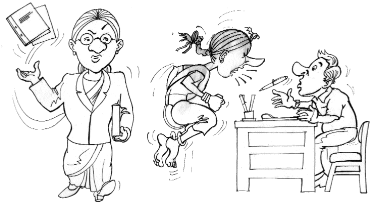
CAN LEGAL AID BE DISCONTINUED TO A PERSON?