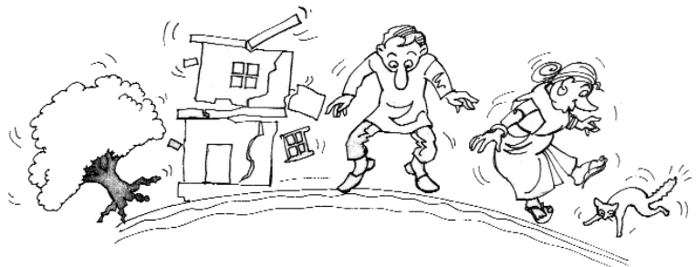
VICTIMS OF MASS DISASTER CAN APPLY FOR LEGAL AID

7. Is unable to engage a lawyer because of reasons such as poverty, is being held in isolation where the person is unable to communicate etc.