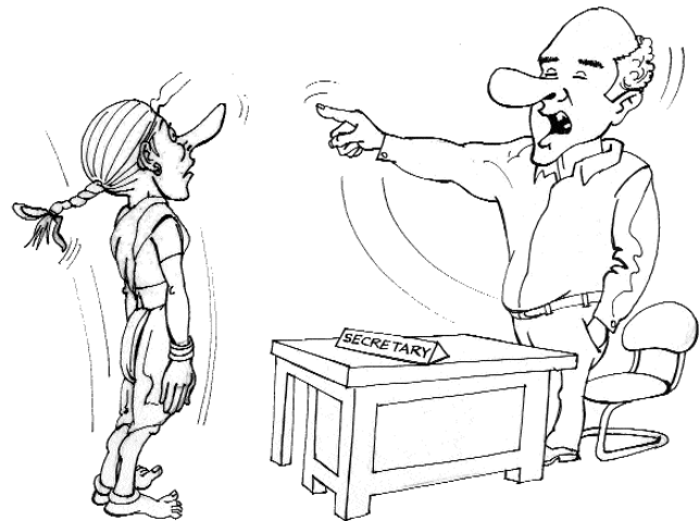
DUTIES OF A PERSON RECEIVING LEGAL AID