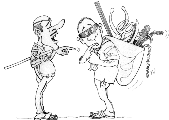
A PERSON UNABLE TO EXPLAIN FOR CARRYING INSTRUMENTS FOR HOUSE BREAKING CAN BE ARRESTED